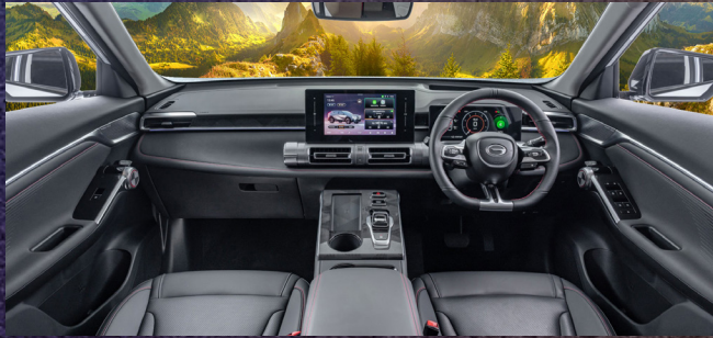
Red & Black